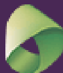
KAIVALYA Education Foundation